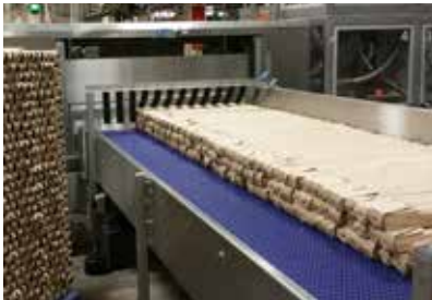
Enlarged driven storage table

The discharge of the Multifeeder-R8 is connected to the Flexbuffer capable of buffering up to two (2) un-wrapped rolls of ends. The Multifeeder can either be fitted with one Flexbuffer for feeding a single infeed seamer, or can be fitted with two Flexbuffers for a single infeed seamer with two different can-end diameters or two independent single infeed seamers (reducing the guaranteed output to 7 rolls per minute).