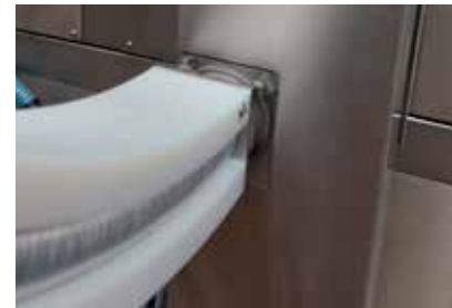
Can-end Discharge towards seamer