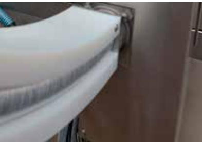
Can-end Discharge towards seamer