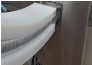
Can-end Discharge towards seamer