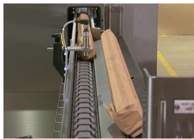
Feeding conveyor upstream unwrapping section